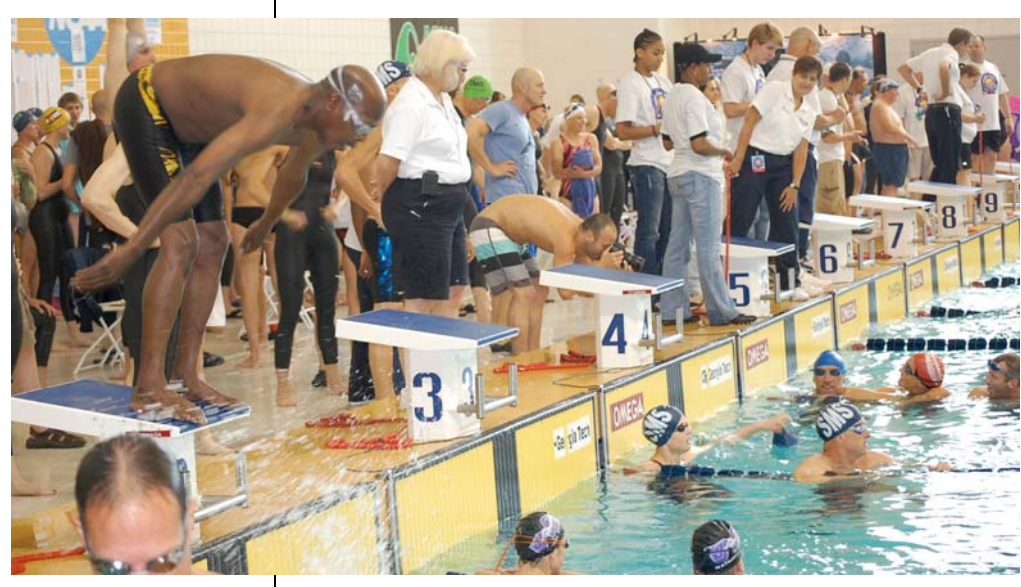
Chaos during the relays – lots of people behind the blocks waiting for the next heat. Swimmers who have finished stay in the water.