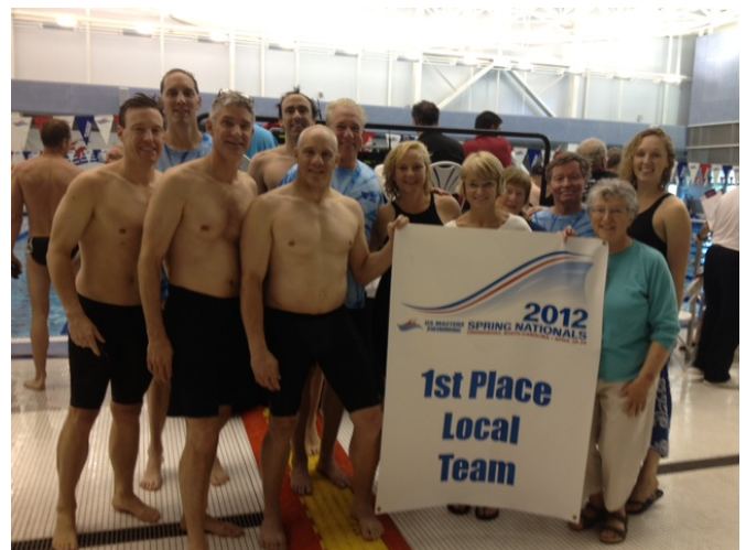
A few of the VMST members with the team award.