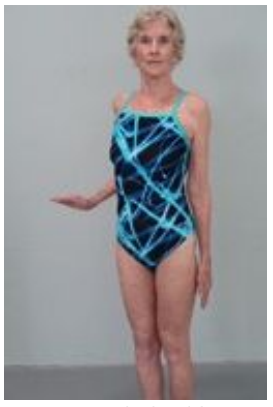
Fig. 5 and 6 (top row): Arm even with shoulder. Fig. 7 and 8 (bottom row): Elbow bend close to body with hand pushing down. The swimmers are rolled towards the arm with face forward.

stroke cycle. There are times in our sport when the arms are straight but always during the recovery phase. In the power phase of every stroke the elbows are bent. Remember the water never gets tired. We do!