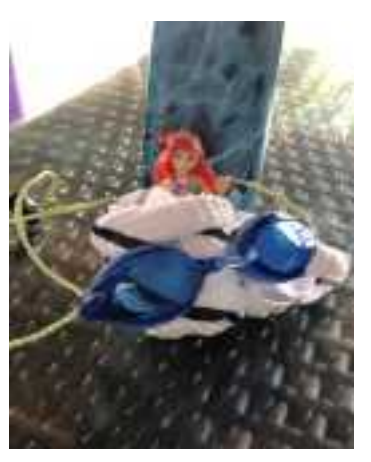
She's been to the beaches and yes, a few bars Where she sometimes performs without going too far.